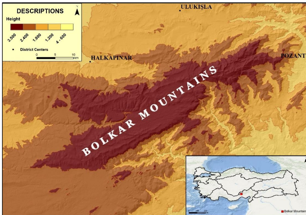
Figure 1. Topographic map of the Bolkar Mountains

Bolkar Mountains are located at the intersection of phytogeographic regions Mediterranean and Irano-Turanian in Türkiye and forms the eastern parts of the Central Taurus Mountains (Figure 1). The highest point is Medetsiz (3524 m). Covering an area of approximately 1290 km 2 , the Bolkar Mountains has quite a variety of habitats such as mixed or pure forests of coniferous and broad-leaved trees, steppe, lake, rivers and streams. Microhabitats, especially in the alpine zone, show great changes due to the interactions between soil moisture, temperature and bedrock, which change depending on the effects of the sun and wind (Atay et al., 2009).